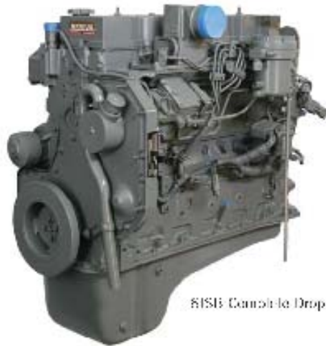
6ISB Complete Drop In

All of DSG's Complete Drop-in engines are 100% dyno tested prior to shipment. Computer controls ensure that each engine dyno test is conducted under standard, repeatable settings. Every engine is run through a warm up cycle; three separate cruise segments simulating light, medium and heavy throttle conditions; maximum torque and horsepower tests; both high and low idle tests; and a black light leak detection test with dyed oil, coolant and fuel.