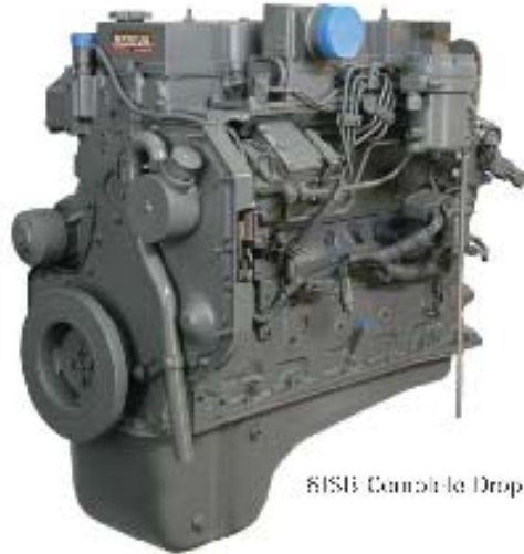
6 ISB Complete Drop In

All of DSG's Complete Drop-in engines are 100% dyno tested prior to shipment. Computer controls ensure that each engine dyno test is conducted under standard, repeatable settings. Every engine is run through a warm up cycle; three separate cruise segments simulating light, medium and heavy throttle conditions; maximum torque and horsepower tests; both high and low idle tests; and a black light leak detection test with dyed oil, coolant and fuel.